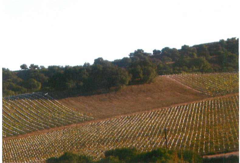
part D of the Blogger's Block, 12/2/08